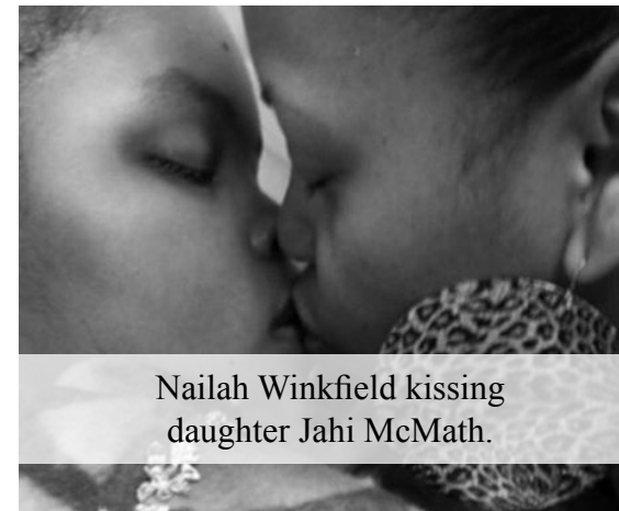
Nailah Winkfield kissing daughter Jahi McMath.

Nailah has witnessed her daughter responding to her voice. While receiving the most basic of care, all of her organs are functioning well, her skin is flawless and she moves. Not bad for a child who's been "deceased" for nearly a year.