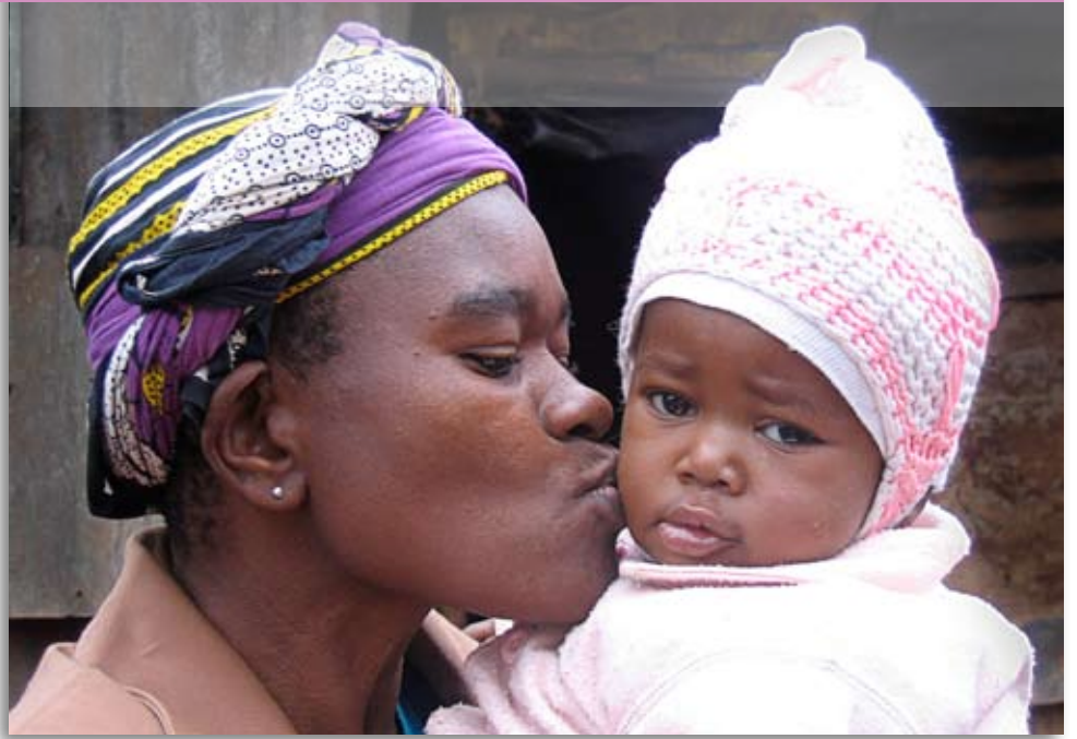
Kenyan mother and child

Evidence shows that legalizing abortion does not reduce maternal mortality